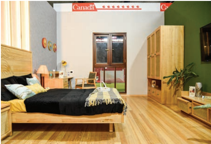
Canadian Wood display at India Wood 2022