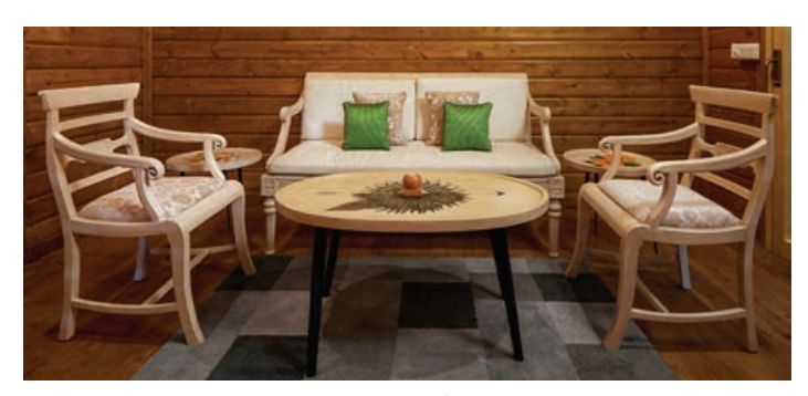
Hemlock product trials, Bramola

highlight the certification and sustainability aspects of Canadian wood, a feature that has the potential to help these companies tap new markets offshore.