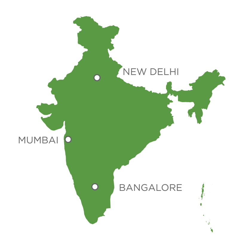
In 2016, the India team established additional technical representatives in New Delhi and Bangalore to better expand market development activities across the country.

The objective of the market development program in India is to see renewed growth in Canadian softwood lumber exports by positioning Canadian species as an alternative to traditional hardwoods in manufacturing applications with a focus on higher-value furniture production, doors, door jambs and windows frames, interior/exterior finishing, and joinery.