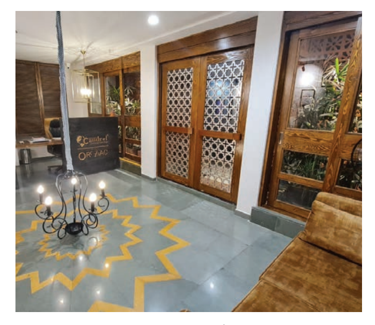
Candrol Centre of Oncology, Jaipur

An oncology centre in Jaipur incorporated the use of B.C. wood in its design to create a relaxing and natural environment for its patients. Douglas-fir was featured in a variety of applications in the centre, including ceiling and wall panelling, doors and doorframes, shelving and furniture. The extensive use of Douglas-fir within the centre created the desired calming atmosphere, while serving as a showcase for the biophilic benefits of Canadian wood species.